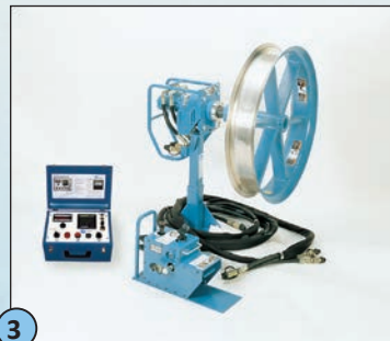
3 *Shown with Optional 30" Capstan.

Base Part No. Description 08690002 Package contains: Fiber Optic Cable Puller, Foot Control and Hoses*