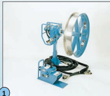
1 *Shown with Optional 30" Capstan.